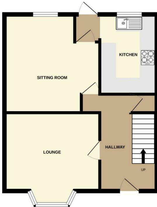
GROUND FLOOR 482 sq.ft. (44.8 sq.m.) approx.